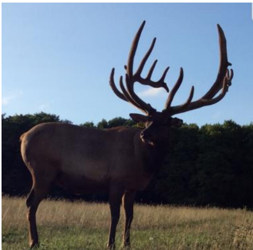
Reg #: C5856