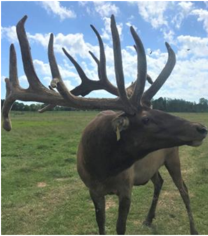
Reg #: A43405