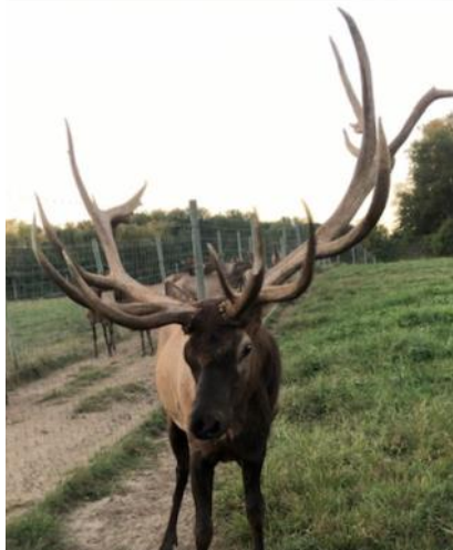
Reg #: A40627

Big clean typical 9x8 Six Year Old! 510" with 63" and 61" beams (unofficial). Silverstar placed 1st at the 2019 NAEBA Competition scoring 511" typical at 6. He was also a NAEBA 2019 People's Choice Award winner. Silver Star is a son of Silvertine and out of a Superstar/Samurai cow that was the best cow on Regal Point Elk Farm. This cow also had sons that scored 555" at 6 (unofficial) and velveted 25.6 at 2 (unofficial). Semen is available in the U.S. for the 2023 breeding season. Contact Neal for shipment.