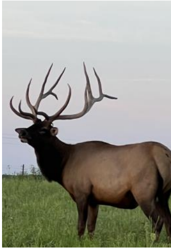
Pictured: Super Cool