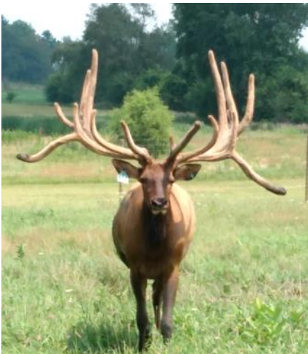
Reg #: A44094