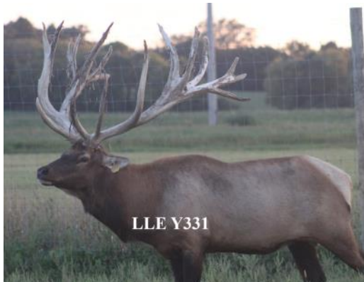
Pictured: LLE 331