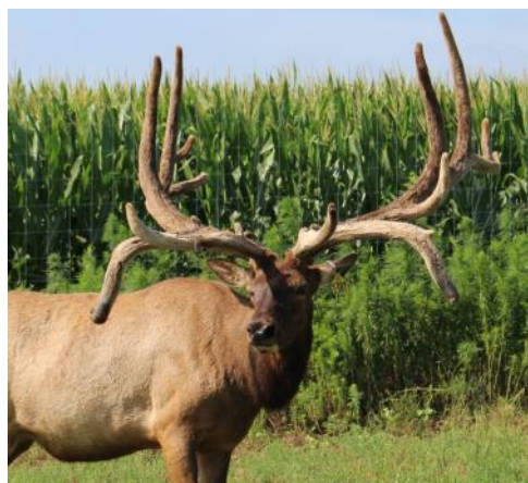
Pictured: EMF Midas