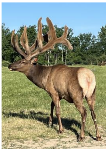
Reg #: A43357

Semen is available in the U.S. for the 2023 breeding season.