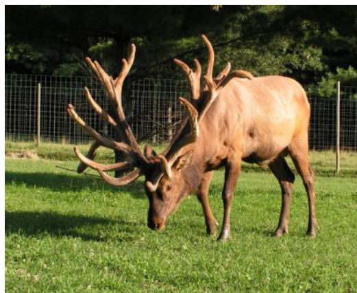
Reg #: A33951