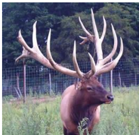
Reg #: A34228

Semen is available in the U.S. for the 2023 breeding season.