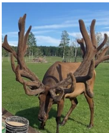
Reg #: C5865