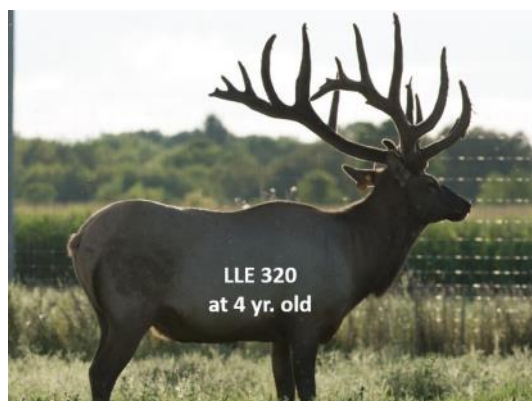
Pictured: LLE 320