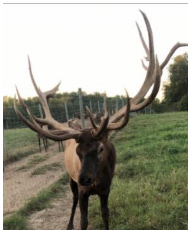
Reg #: A40627