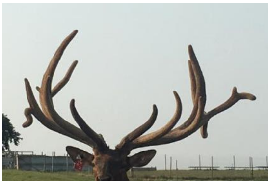
Reg #: A41533