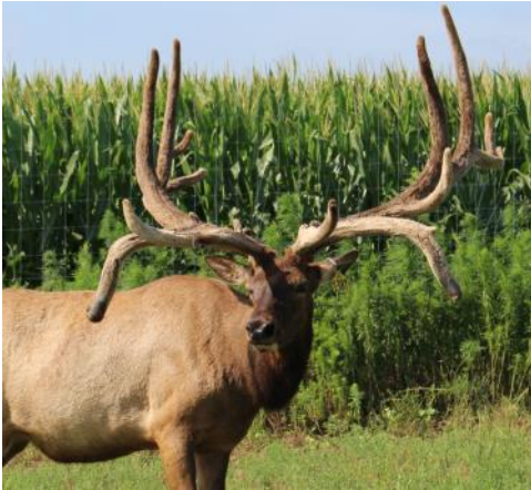
Pictured: EMF Midas