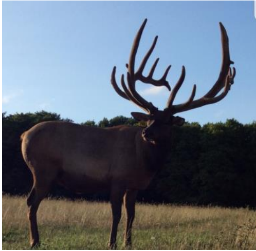
Reg #: C5856