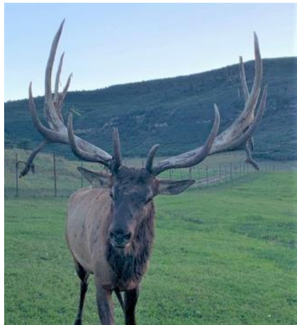
Reg #: A39252