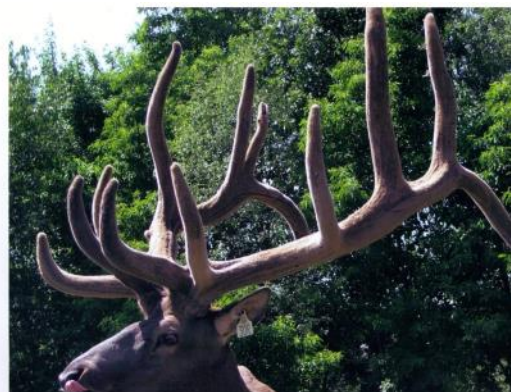
Reg #: A35506