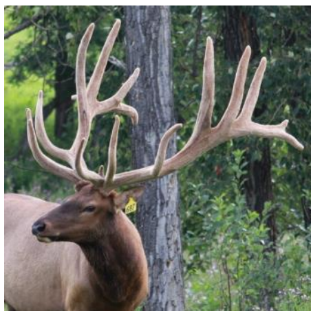
Reg #: C5819

Too many competition winning/placing/competing class sons to even count. Styx has the unique ability to sire some of the biggest nontypical and typical sons in the elk industry. One of, if not the greatest bull, for passing his world class genetics. Styx females are now of age to show they are continuing his legacy and are dams to incredible sons. We haven't sold or donated any Styx semen for the last several years. These lots will be the only Styx semen we release this year and for the foreseeable future. Available in the U.S. and Canada for the 2022 season.