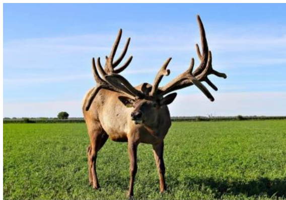
Reg #: A38474