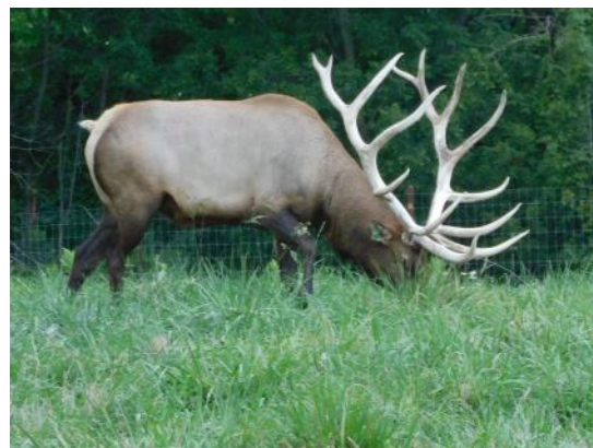
Reg #: A42821