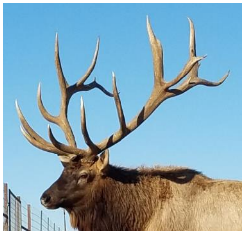
Reg #: A40307

With a clean typical frame like this, his sons will be in demand by the preserves. Along with his production and style comes a strong line of pedigree. His sire is X-Ray (532" SCI master measured, NAEBA unofficial) out of a Levi dam (Levi 575" green), and the Grand Dam is by Prospect (Prospect 568" Green) (all unofficial). Three generations of sires well over 500". For those looking for an interesting typical bull with background sires in the high 500's, here it is. Available in U.S and Canada.