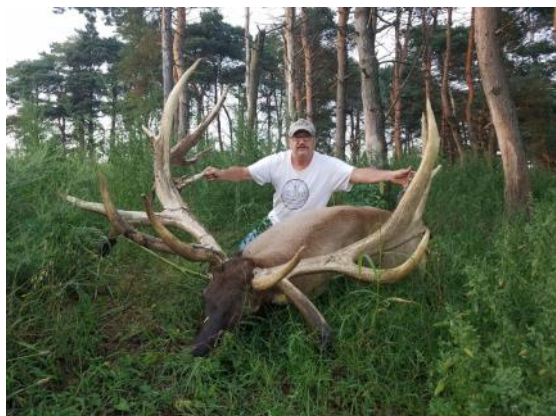
Reg #: A45052

Zeus is a Tequila son. Zeus cut 20lbs. at two placing second to Styx in the 2011 NAEBA Antler Competition. Zeus has a great combination of width, beam diameter, tine length and placement. In 2012 Zeus was grown out and unofficially scored 497" at 3, with 46" inside spread. Zeus had a 416" typical frame with 106 and 107 inches of typical tines.. Zeus' sons have his great tine length and velvet cutting weights to show Zeus is passing on his top genetics. Zeus has sired many sons that have competed in the NAEBA competition. Zeus had the unfortunate luck to be born in the same year as Styx; had he been given the opportunity Zeus could have performed just as well. Semen is available in both the U.S. and Canada for the 2022 breeding season.