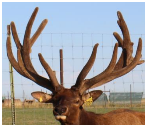
Reg #: A40000