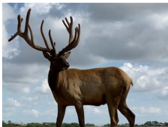
Amayesin Reg #: A44336 Stryker Reg #: A40004