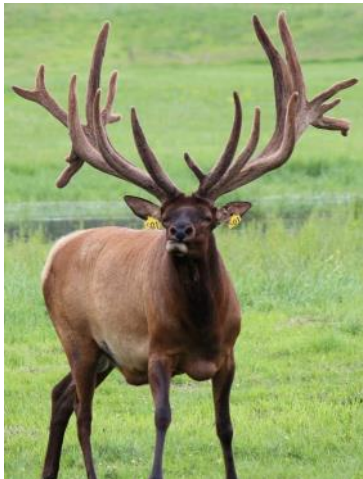
Reg #: C5751

Semen is available for this sale in the U.S. for the 2022 breeding season.