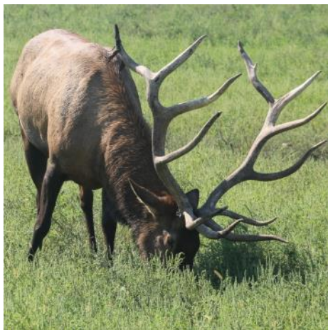
Pictured: LLE Y815

Semen is available in the U.S. for the 2022 breeding season.