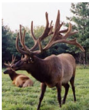
Reg #: A27976

Semen available in the U.S. and Canada for the 2022 breeding season.