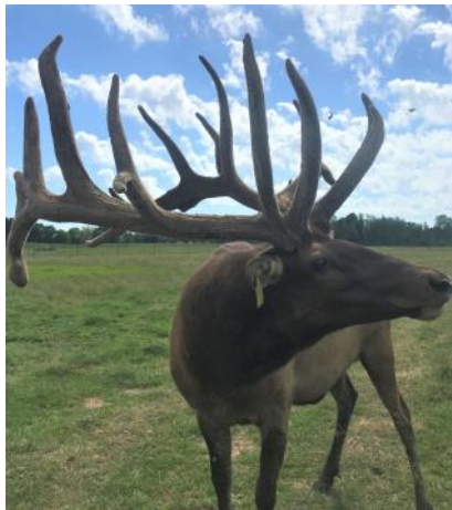
Reg #: A43405

If the market changes, the demand for big typicals will stay strong. Long beams, good clean tine placement, Silver Star is a solid choice for your future genetics. Silver Star is a son of Silvertine and out of a Superstar/Samurai cow that is the best cow on Regal Point Elk Farm. This cow also has sons that scored 555" at 6 (unofficial) and velveted 25.6 at 2 (unofficial). Semen is available in the U.S. and Canada for the 2022 breeding season.