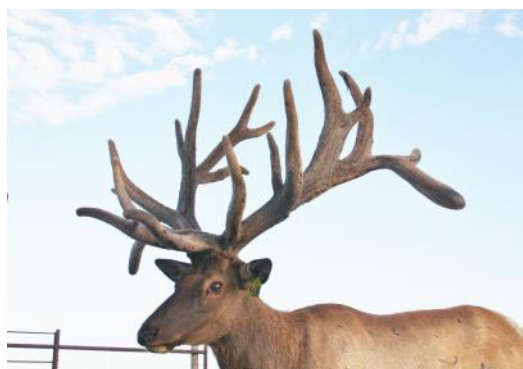
Reg #: A38576

There are a limited number of straws available in the U.S. and Canada for the 2022 breeding season.