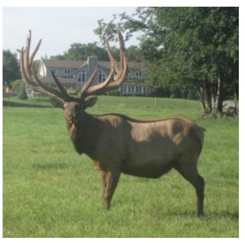
Reg #: C5741