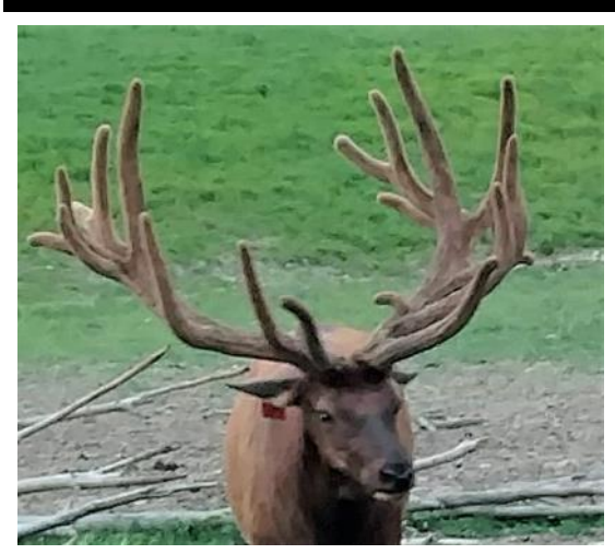
Reg #: A43356

Semen is available in the U.S. for the 2020 season.