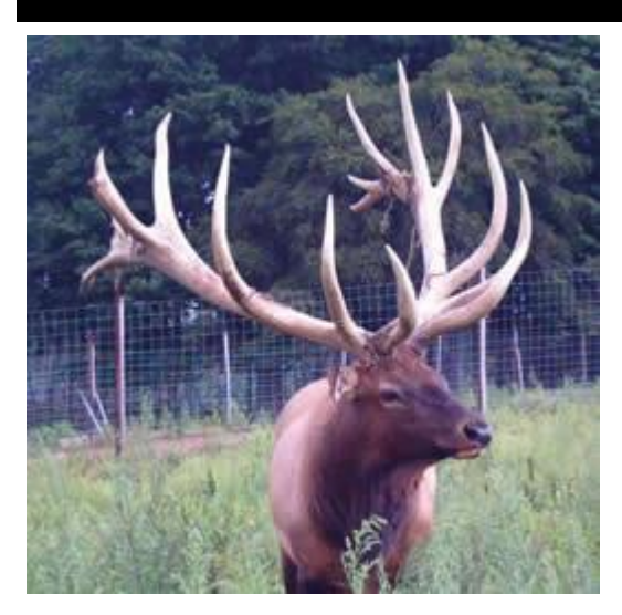
Reg #: A34228

Semen is available in the U.S. and Canada for the 2020 breeding season.