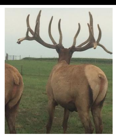
Reg #: A41145

Semen is available in both the U.S. and Canada for the 2020 season.