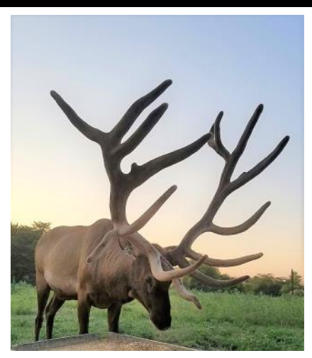
Reg #: A40307

Silver Star is a son of Silvertine and out of a Superstar/Samurai cow that is the best cow on Regal Point Elk Farm. This cow also has sons that scored 555" at 6 (unofficial) and velveted 25.6 at 2 (unofficial). Semen is available in the U.S. and Canada for the 2020 breeding season.