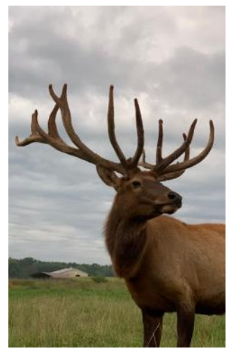
Reg #: A42858