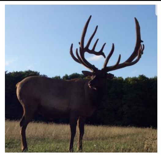
Reg #: C5856