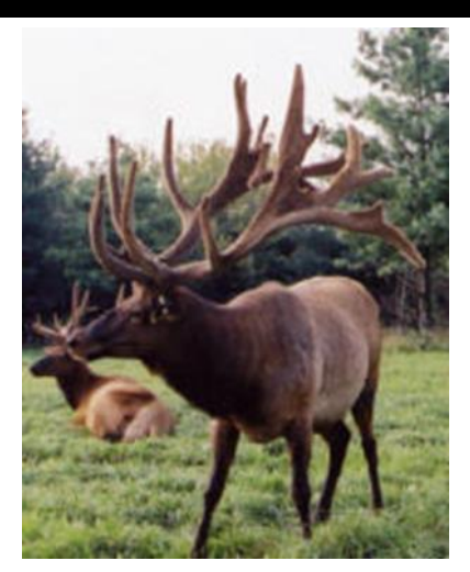
Reg #: A27976