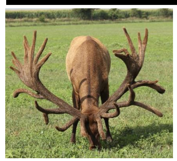
Reg #: A40004

Semen is available in the U.S. for the 2020 season.