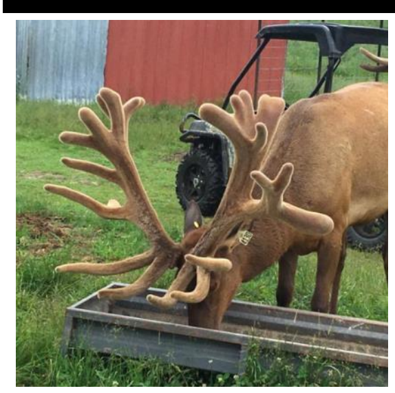
Reg #: A43368

Semen is available in the U.S. for the 2020 season.