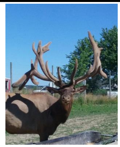
Reg #: A39252