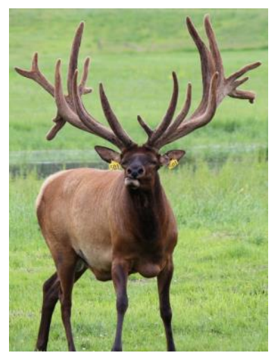
Reg #: C5751