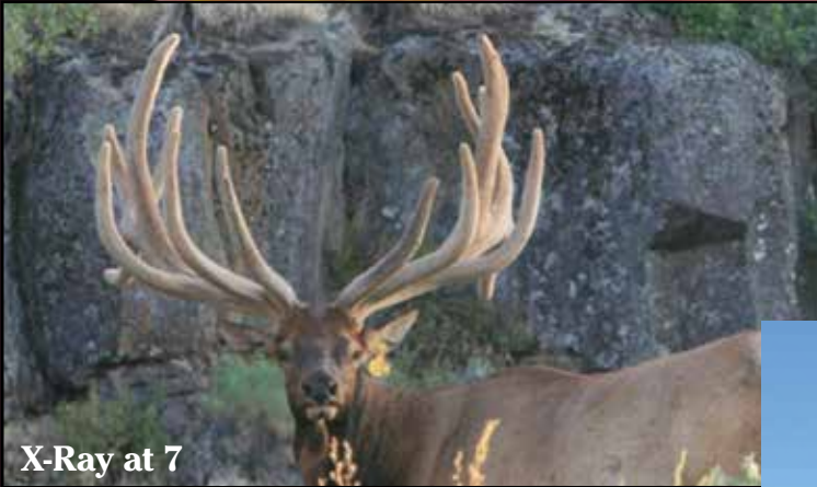
X-Ray at 7

HONEST JACK • JOHNNIE B ICE • JUSTICE LITIGATOR SPREAD EAGLE • HANZON • X-RAY