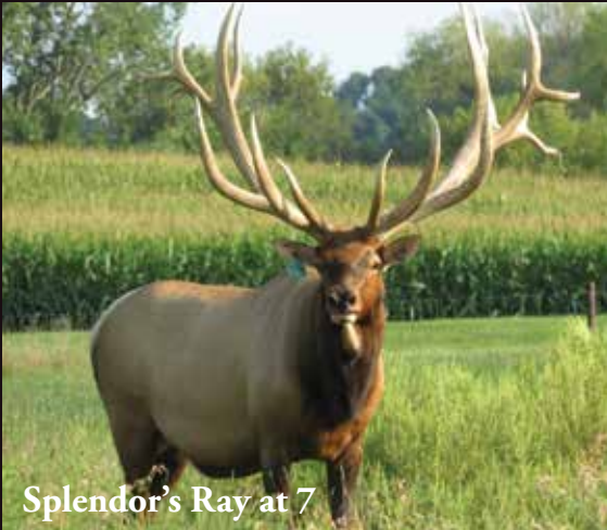
Splendor's Ray at 7