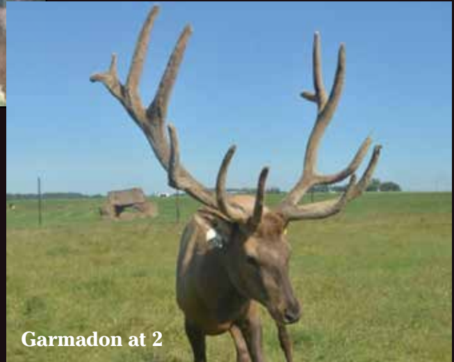
Garmadon at 2

SCI Master measured at 514 4/8" on head, 51 1/8" actual spread at seven, unofficial. Natural sheds scored 496 0/8" at the 2010 International Antler Competition.